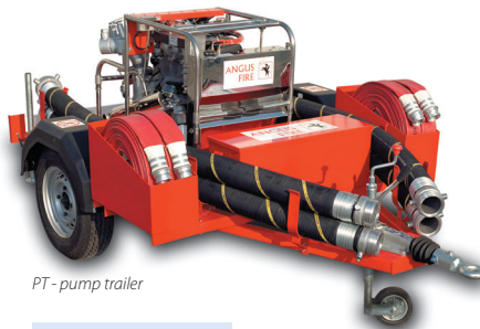
PT - pump trailer