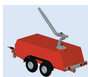
TMT-2000 - 2,000 litre tank & monitor trailer

The STORMforce range features many advantages: