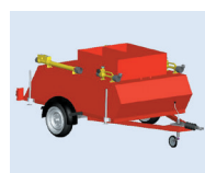
BIT-1000 - 1,000 litre base injection trailer