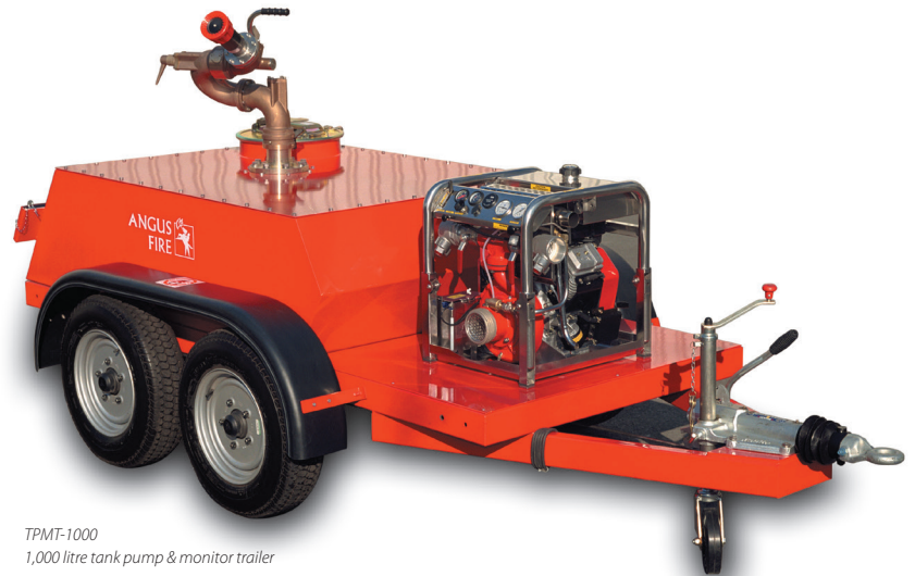
TPMT-1000 1,000 litre tank pump & monitor trailer

The Angus Fire STORMforce range of fire fighting trailers provides powerful fire fighting performance for a wide range of applications from emergency pumping duties to bulk storage tank protection. They are ideal for providing fast flexible emergency response around a large site or cluster of smaller sites in a locality, with diverse equipment options.