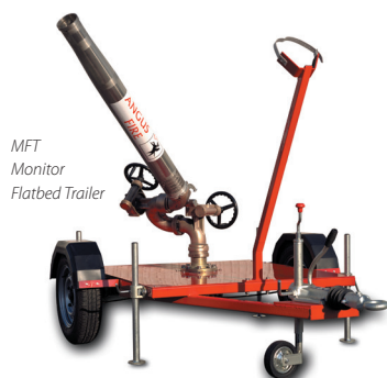
MFT Monitor Flatbed Trailer

Based on 3 chassis designs STORMforce trailers provide a rapid and cost-effective response to your fire fighting needs.