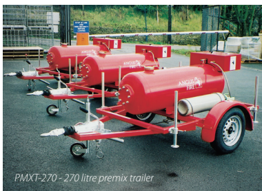
PMXT-270 - 270 litre premix trailer

Compact, lightweight flatbed trailer suitable for rapid deployment of Angus Fire Titan monitor.